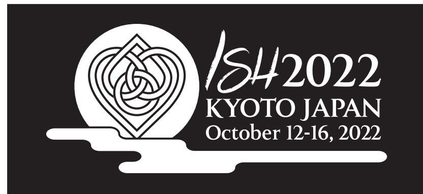
Outlined in white