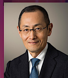
Prof. Shinya Yamanaka

Former Dean, Kyoto Univ. iPS Cell Center 2021 Nobel Prize laureate