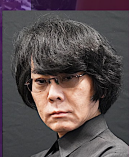
Prof. Hiroshi Ishiguro

Dept. of Systems Innovation, Osaka Univ. • ATR Hiroshi Ishiguro Laboratories