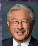
Prof. Victor J. Dzau

President of the United States National Academy of Medicine