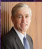
Prof. Richard P. Lifton

Former Dean, Kyoto Univ. iPS Cell Center 2021 Nobel Prize laureate